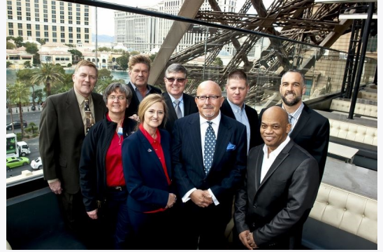
2018 NPFMA Board of Directors

The Nevada Professional Facility Managers Association was founded in November 1991. The Mission of the organization is to be a professional association dedicated to the enhancement of engineering, maintenance, operations and management of commercial, institutional and industrial facilities. NPFMA will move toward the future enlightened through education, communication and alliance.